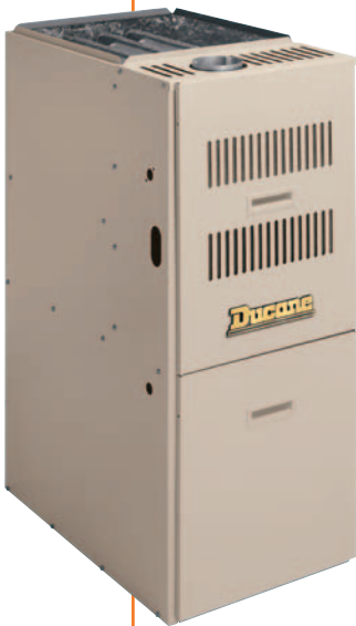
Approximate Five-Year Natural Gas Cumulative Energy Savings for 95% AFUE New Furnace vs. 60% Efficient Furnace †